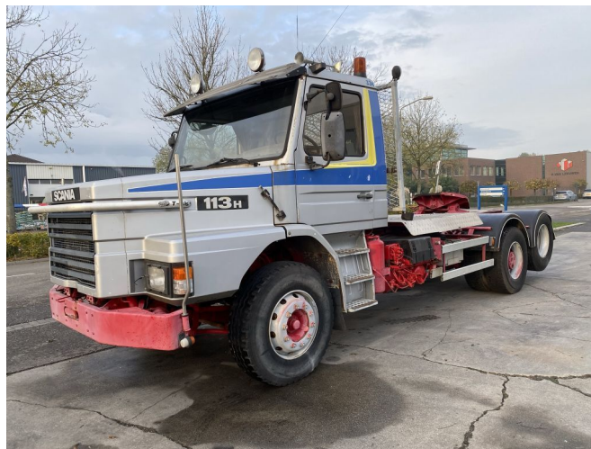
Scania T113-360 6X2 - MANUAL - FULL STEEL