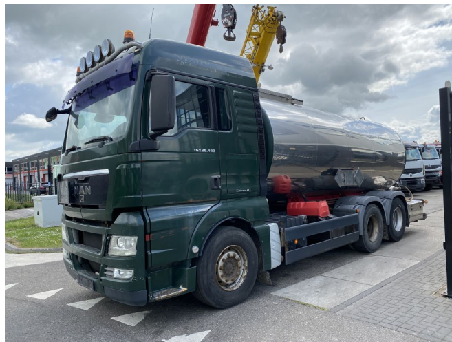
MAN TGX 28.480 6X2 MANUAL + 15.000 LITER - BITUM TANK