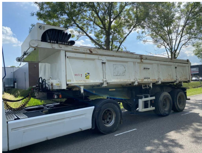
CIF 2 AXLE - STEEL SUSPENSION - TIPPER