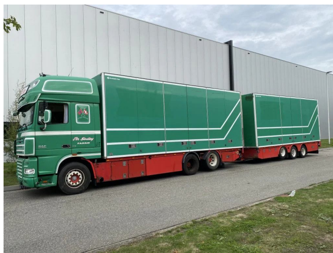
DAF XF 510 XF510 6X2 RETARDER MET AANHANGER