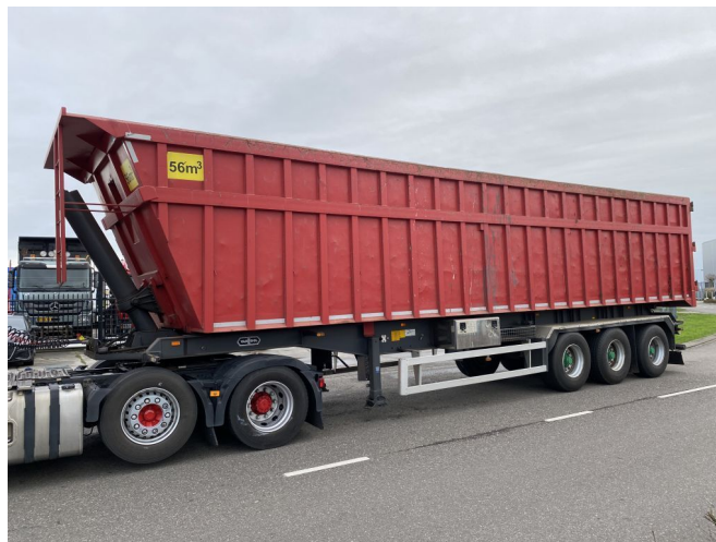
VAN HOOL 3C1017 - TIPPER - 56 M3 - STAHL/STEEL - 3 AX...