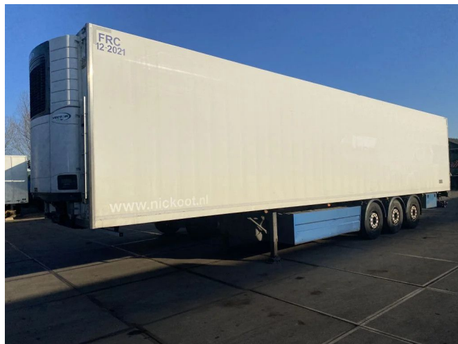
Schwarz Müller WITH MEATRAILS AND DOUBLE EVAPORA...