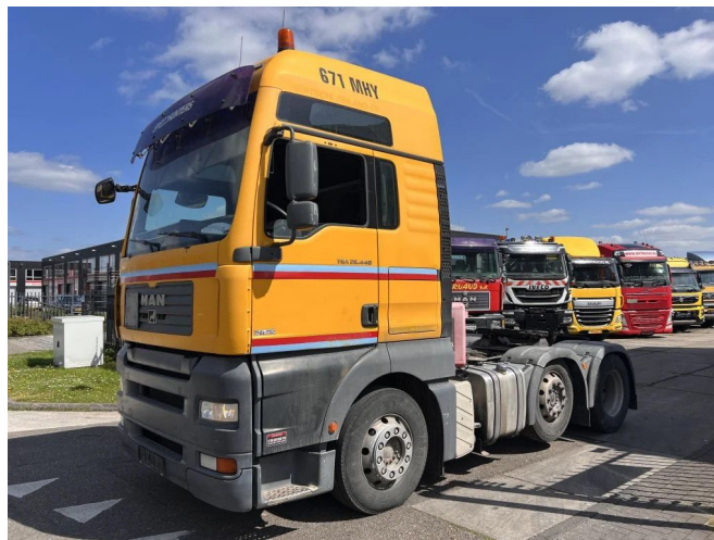
MAN TGA 26.440 XXL 6X2 E4 MANUAL GEAR - TIPPER HY...