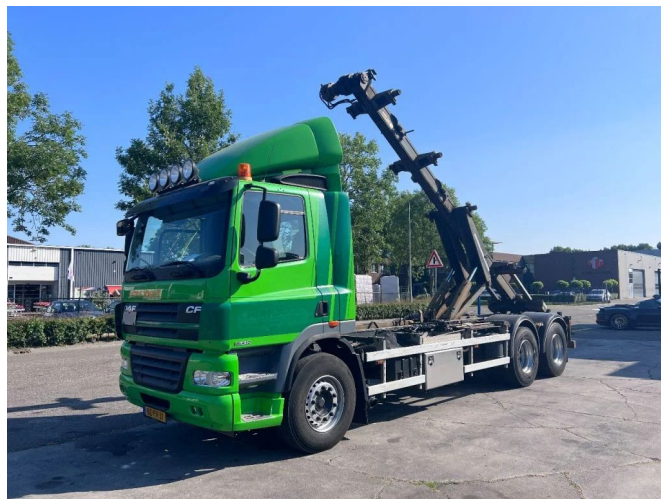
DAF CF 85.410 6X2 EURO 5 + TRANSLIFT CHAIN