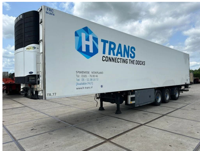
VAN ECK 3 AXEL CARRIER VECTOR 1850 D/E