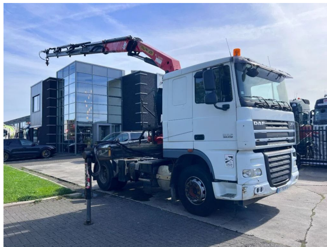
DAF XF 105.410 4X2 EURO 5 MANUAL + PALFINGER PK16...