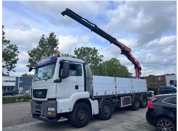
MAN TGS 35.440 8X4 + HMF 2220 K2 MET REMOTE