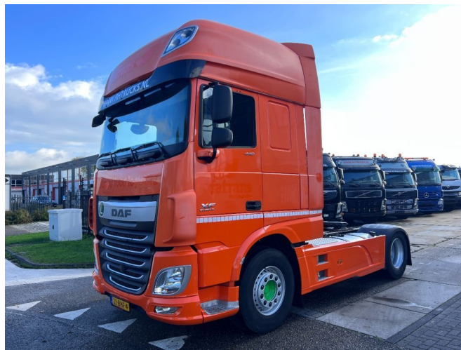
DAF XF 440 SSC 4X2 EURO 6 STANDAIRCO APK