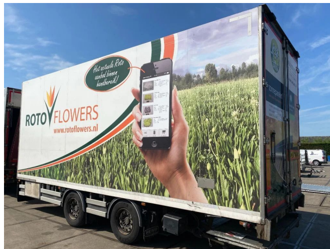
DRACO 2 AS - SAF + FRIGOBLOCK