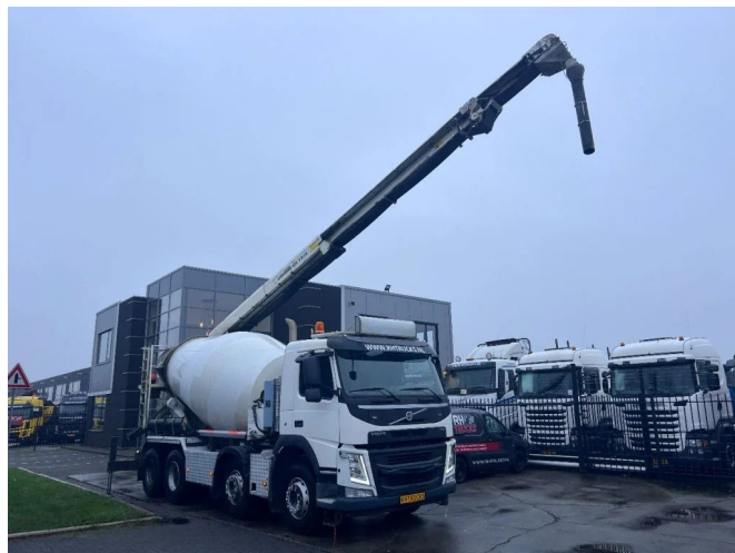
Volvo FM 410 8X4 MIXER 9m3 + LIEBHERR CONVEYOR BELT