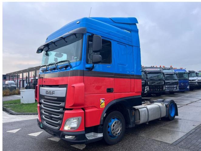
DAF XF 440 SC 4X2 EURO 6 MEGA