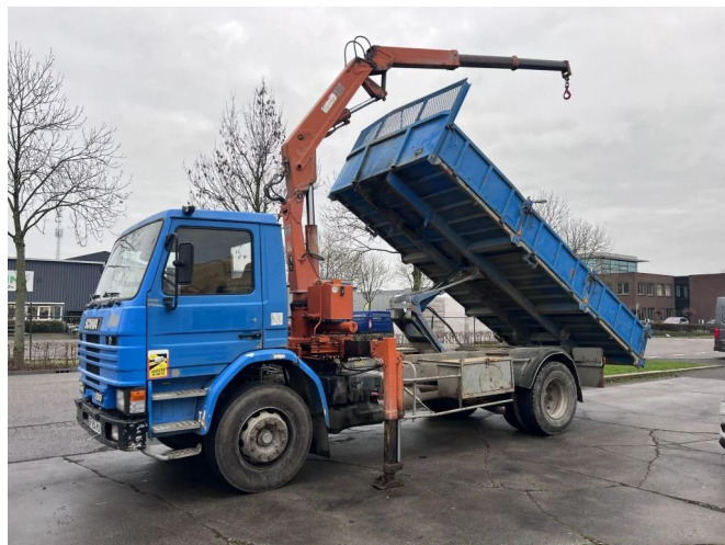
Scania P93 H 280HP 4X2 + ATLAS CRANE + KIPPER