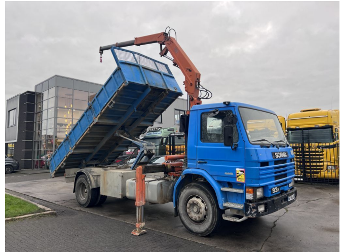
Scania P93 H 280HP 4X2 + ATLAS CRANE + KIPPER