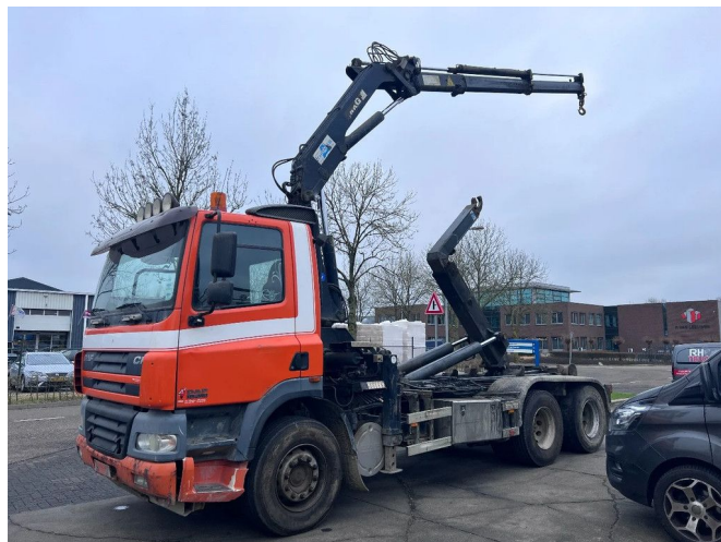
DAF CF 85.380 6X2 + MKG 141 A2 CRANE + 20 TON HOOK...