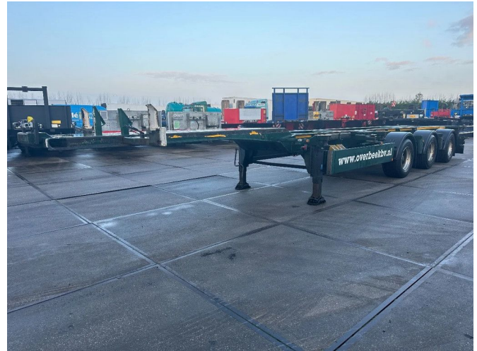
Renders 1 + 3e AXEL STEERING, LZV, 20,40,45 FT