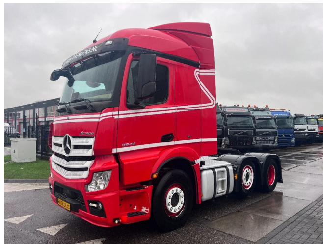
Mercedes-Benz Actros 2546 6X2 EURO 6 LIFT AXLE