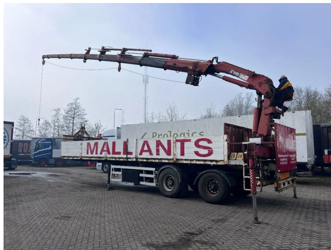
ATM 2 AS + HIAB 300-4 + WINCH