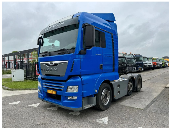
MAN TGX 26.460 6X2 EURO 6 + HYDRAULICS