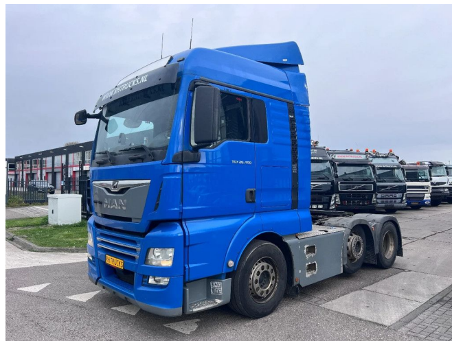
MAN TGX 26.460 6X2-2 EURO 6 LIFT AXLE