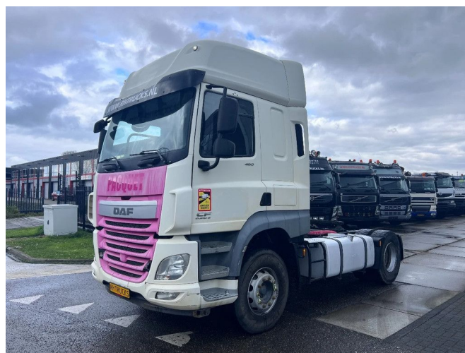
DAF CF 460 4X2 EURO 6 RETARDER + TIPPER HYDRAULIC