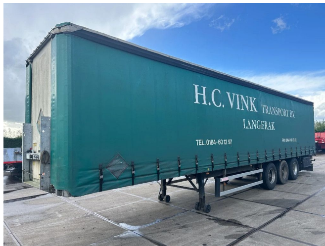
Groenewegen BPW DRUM BRAKES