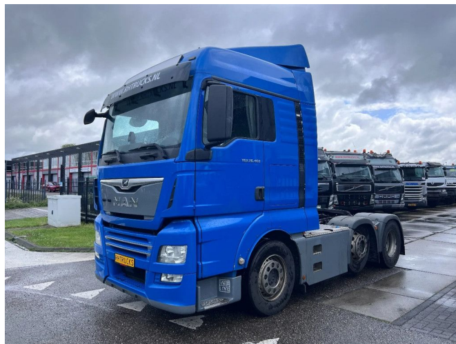
MAN TGX 26.460 XLX 6X2-2 EURO 6 LIFT AXLE