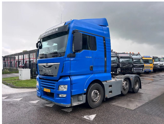
MAN TGX 26.460 XLX 6X2-2 EURO 6 LIFT AXLE