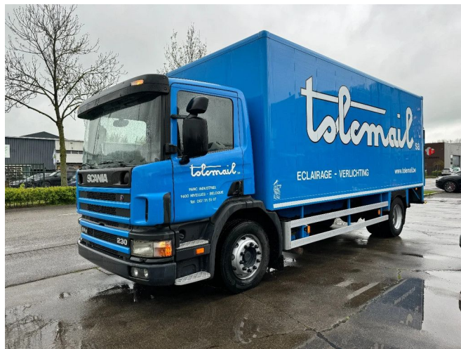
Scania P94-230 4X2 MANUAL GEAR - FULL STEEL SUSP. - ...