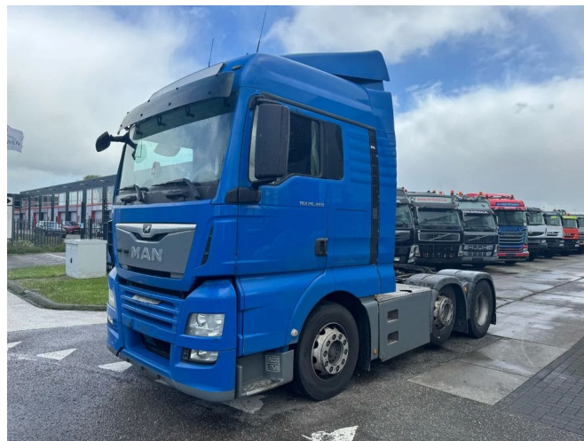
MAN TGX 26.460 XLX 6X2-2 EURO 6 LIFT AXLE