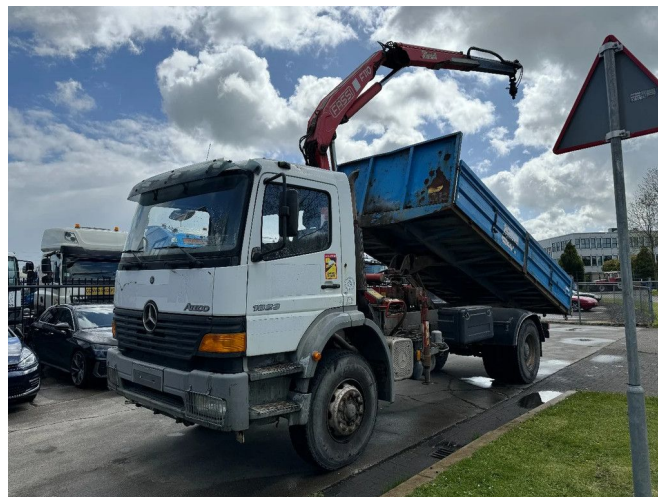
Mercedes-Benz Atego 1823 4X2 + FASSI F110A.21 + TIPPER...