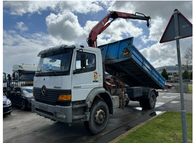
Mercedes-Benz Atego 1823 4X2 + FASSI F110A.21 + TIPPER...