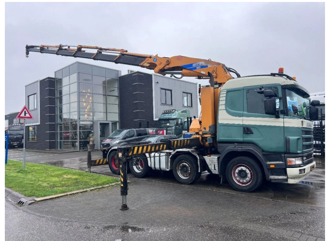
Scania R124-420 8X4 EURO 3 + EFFER 950/6S + 1 + REMOTE