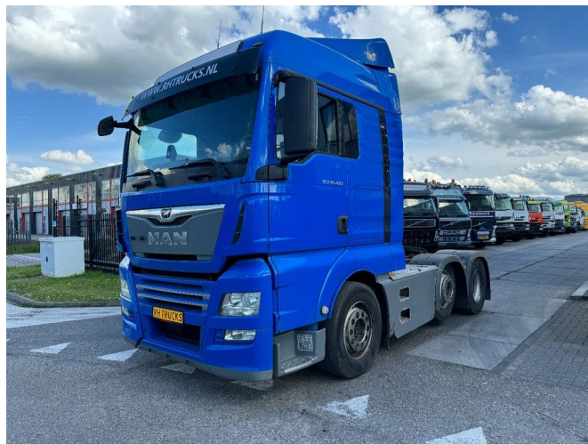
MAN TGX 26.460 XLX 6X2-2 EURO 6 LIFT AXLE