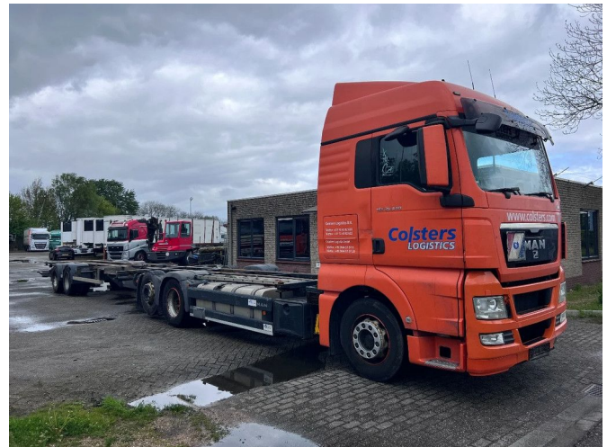
MAN TGX 26.440 XLX 6X2 + HANGER EURO 5 - BDF CHA...